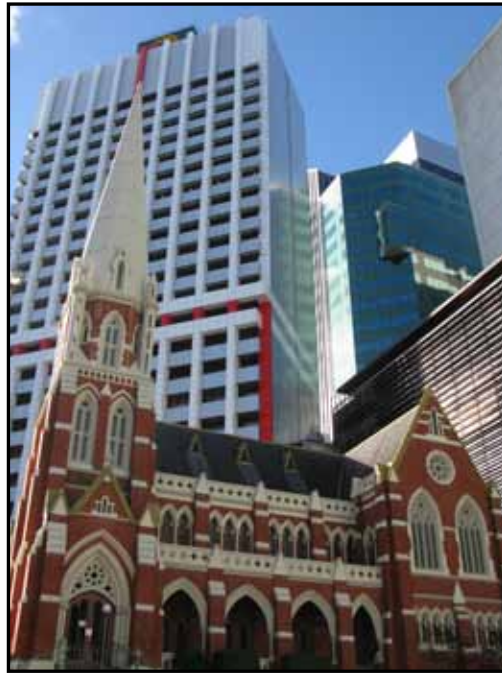
Old and New by Ruth

Go online www.olderdykes.org/gallery/interaction.html to see all of the entries.