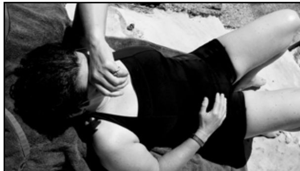
Day in the Sun by Rose