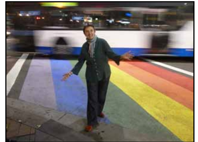
Rainbow Pride by Mystie