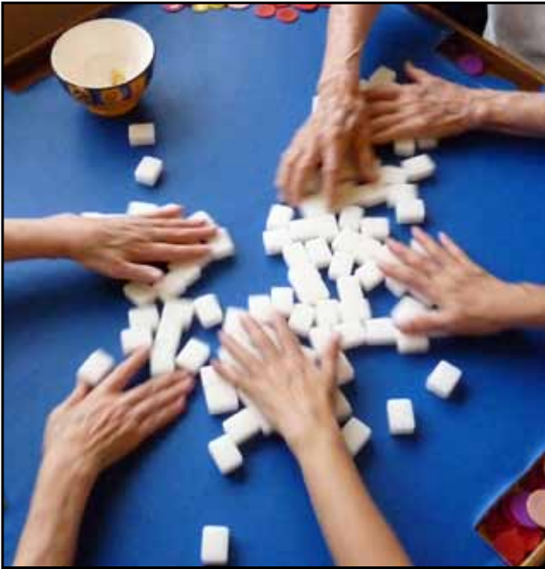
Mahjong session by Ping