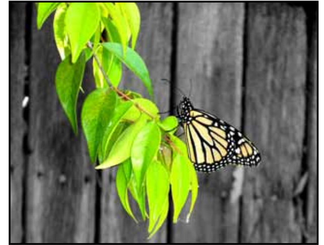
Backyard Butterfly by Angela