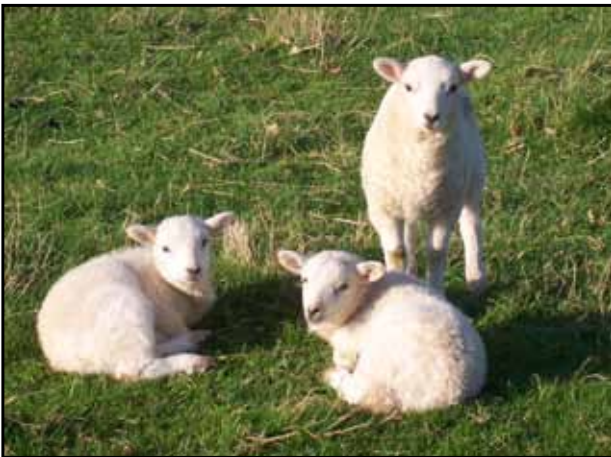
Three little lambs by Gail